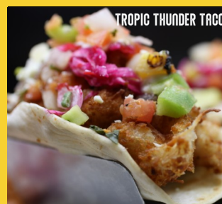
TROPIC THUNDER TACOS